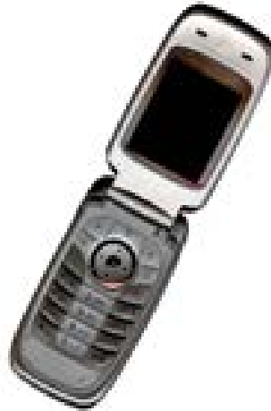
Fig. 2: Example of an unacceptable low-resolution image

Figures must be numbered using Arabic numerals. Figure captions must be in 9 pt Regular font. Captions of a single line (e.g. Fig. 2) must be centered whereas multi-line captions must be centered (e.g. Fig. 1). Captions with figure numbers must be placed after their associated figures, as shown in Fig. 1.