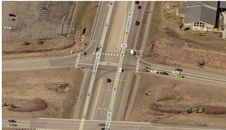
Fig. 3: Example of an image with acceptable resolution

e-ISSN : , p-ISSN : , www.tgi.org.ng Volume X, Issue X (XXX, 2017), PP.XX-XX